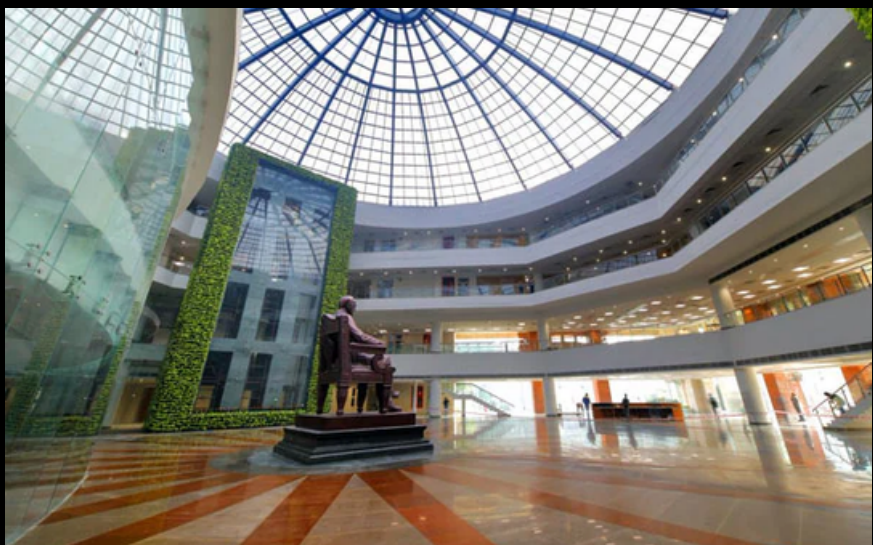
Location: Ambedkar International Centre, New Delhi

As a unique career-launching feature, around half of each graduating cohort will receive job opportunities within the policy ecosystem.